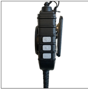
Volume +/- and loudspeaker mute side buttons

With two large Push-To-Talk buttons, enhanced control buttons and IP67 protection rating, the Titan MM50 is the must-have Remote Speaker Microphone for first responders. The Nexus and 3.5mm jack sockets makes headset integration easy and is the ideal solution for users needing to connect helmet audio systems with a portable radio.