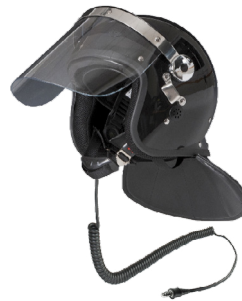
PUBLIC SAFETY SOLUTIONS