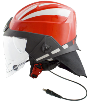
FIRE & RESCUE SOLUTIONS