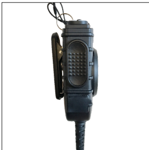
Large side PTT and 3,5mm listen only jack socket