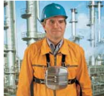
SSR 30/100 B