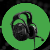
Sordin left/RIGHT CO CC