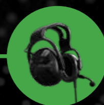
Sordin left/RIGHT CC