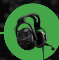
Sordin left/RIGHT CO CC