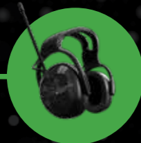
Sordin left/RIGHT FM Pro

The battery time is generous, for example appr. 300 hours for the CO Pro and CO CC models. Even so, we equipped all electronic models (except CC) with a battery save function, which automatically turns off the hearing protector after four hours of idle time. So, you can trust the batteries to be ok even if you'd leave your Sordin left/RIGHT on by accident over night.