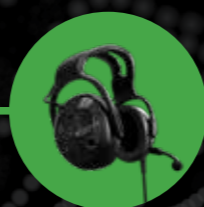
Sordin left/RIGHT CO CC