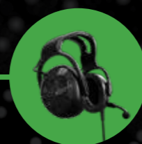
Sordin left/RIGHT CC