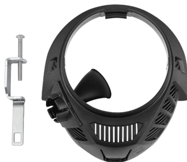
G1 Upgrade Kit PN 10194308