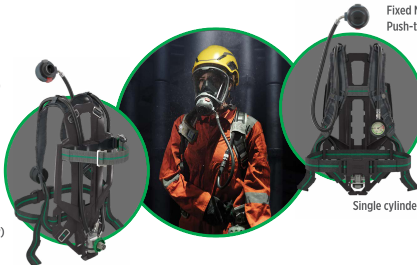
Fixed M1 Demand valve, AS type, Push-to-connect (L3)