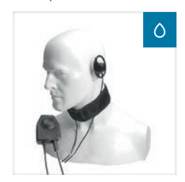
CXR16/DX* Throat mic/headset with heavy-duty PTT