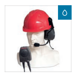
CHP450HS/DX* Single-sided ear defender headset for hard hat use