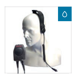
CXR5/DX* Bone conductive skull mic with in-line PTT